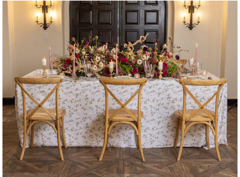
Above: Vineland in Linen paired with our Linen Tuscany napkin. Below Vineland in Smokey Blue paired with our Denim Hampton Napkin.