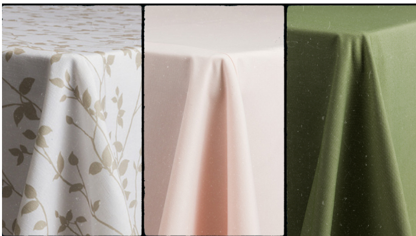
Linen Vineland, Blush Hampton and Leaf Hampton