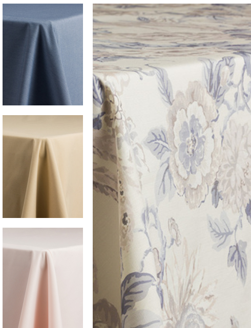
Dolphin Valentina, Denim Hampton, Linen Hampton, Blue Hampton

Designer pallets make planning a beautiful, cohesive event easy.