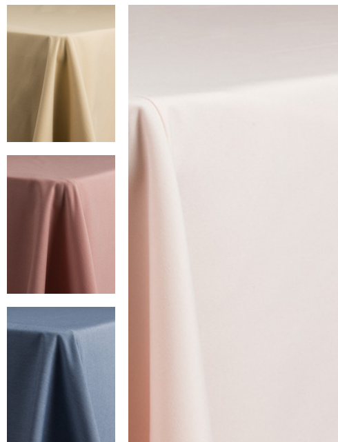
Blush, Linen, Coral, Denim Hampton