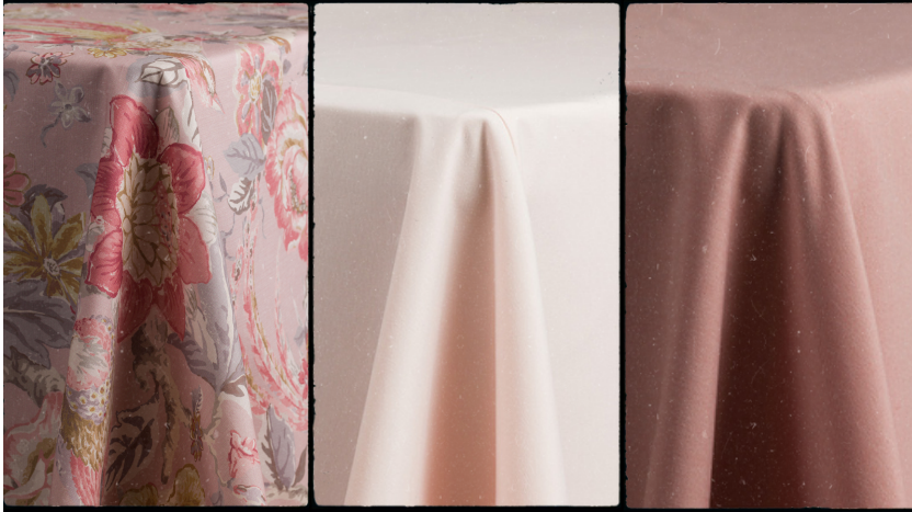
Blush Valentina, Blush Hampton, Coral Hampton

Designer pallets make planning a beautiful, cohesive event easy.