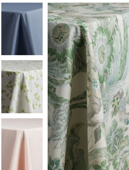
Sage Valentina, Denim Hampton, Green Tea Vineland, Blush Hampton