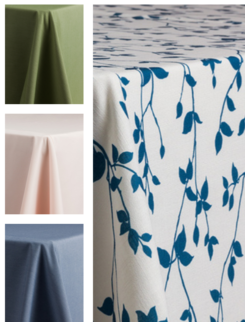
Smokey Blue Vineland, Green Tea, Blush, Denim Hampton.