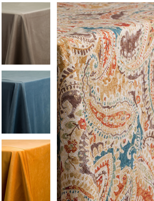
Taupe, Azure and Turmeric French Velvet with Siena Pisces

Designer pallets make planning a beautiful, cohesive event easy.