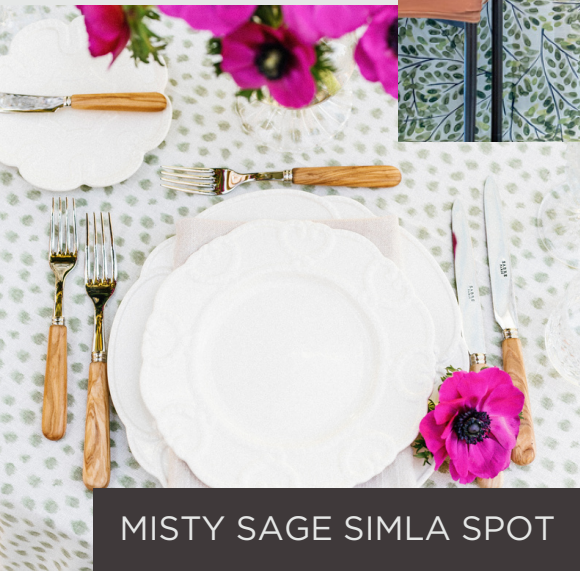
MISTY SAGE SIMLA SPOT

Elevate your event's ambiance with our Green Tea Leaf printed table linen, available for rental. Perfect for weddings, garden parties, or any occasion where nature-inspired elegance is desired, these linens seamlessly blend sophistication with the beauty of the outdoors.