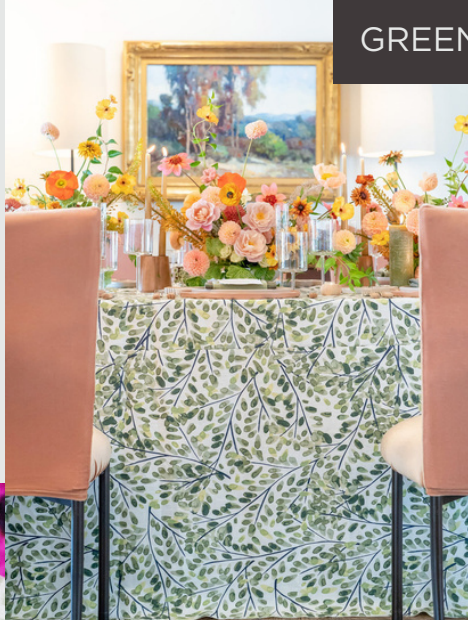
GREEN TEA LEAF

Elevate your event's ambiance with our Green Tea Leaf printed table linen, available for rental. Perfect for weddings, garden parties, or any occasion where nature-inspired elegance is desired, these linens seamlessly blend sophistication with the beauty of the outdoors.