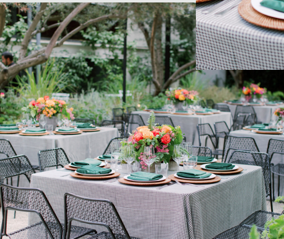
Table Linen: Houndstooth with Forest Green French Velvet

Luxury napkins, often overlooked, possess the power to elevate the entire ambiance of an event. Napkins offer an opportunity to add a pop of color to the table setting, complementing or contrasting with the tablecloth or runner. A well-coordinated color scheme enhances the aesthetic appeal and ties the entire table decor together.