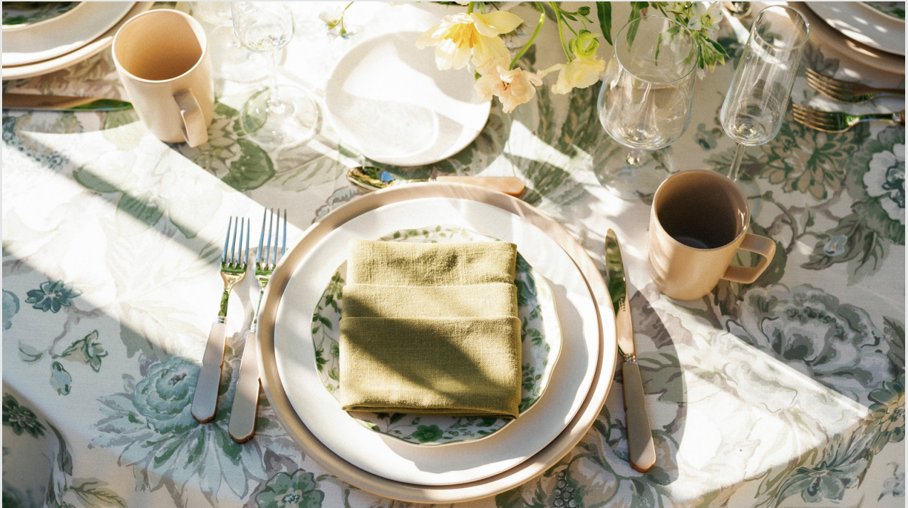
Table Linen: Sage Green Valentina with Green Tea Tuscany Linen