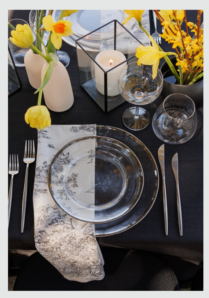
Planning: With Love by Katie, Venue: The Swanner House, Florals: With Love Floral Co, Tabletop Rentals: Borrowed Blu, Chair & Table Rentals: Signature Party Rentals

Never underestimate the power of the right napkin. Our new Ebony and Cream Toile de Jouy fabric is the perfect balance to modern table settings, especially when paired with a clear glass charger and black Tuscany linen tablecloth. Featuring more than ten distinct pastoral scenes—ranging from ducks to orchards and graceful cranes—each napkin feels like an individual work of art. This exquisite fabric transforms any table into a refined yet modern masterpiece, making it the perfect choice for events that demand elegance with a touch of timeless charm.