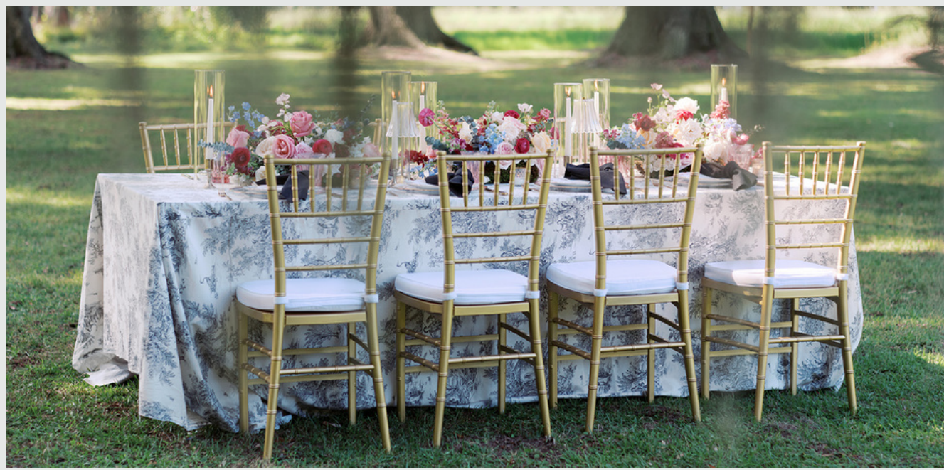
VENDORS CREDITS FOR COVER AND THE ABOVE PHOTO: PLANNING AND VENUE: COTTON HALL, RENTALS: MCCOY'S EVENT PROFESSIONALS, FLORAL: TULIPS AND TWIGS