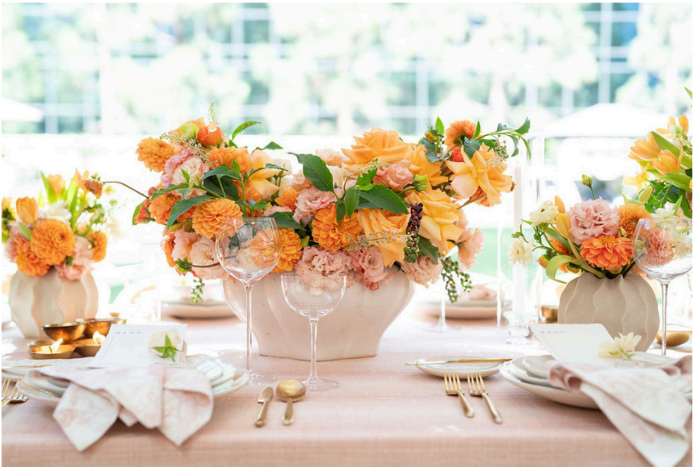
LINEN USED; BLUSH OKAY OMBRE WITH BLUSH SAVANNAH PRINT NAPKINS. CREATIVE TEAM BEHIND THIS TABLE: PLANNING AND DESIGN: STERLING ENGAGEMENT, FLOWERS: XO BLOOM, RENTALS: PREMIERE PARTY RENTALS, VENUE: JONATHAN CLUB, DOWNTOWN LA

This tablescape perfectly balances a refined aesthetic with an approachable, organic feel. The blush linen complements the peach and orange hues of the floral arrangements, amplifying their natural beauty. It's a design that showcases the beauty of simplicity while inviting guests to sit, relax, and enjoy the thoughtful details surrounding them.