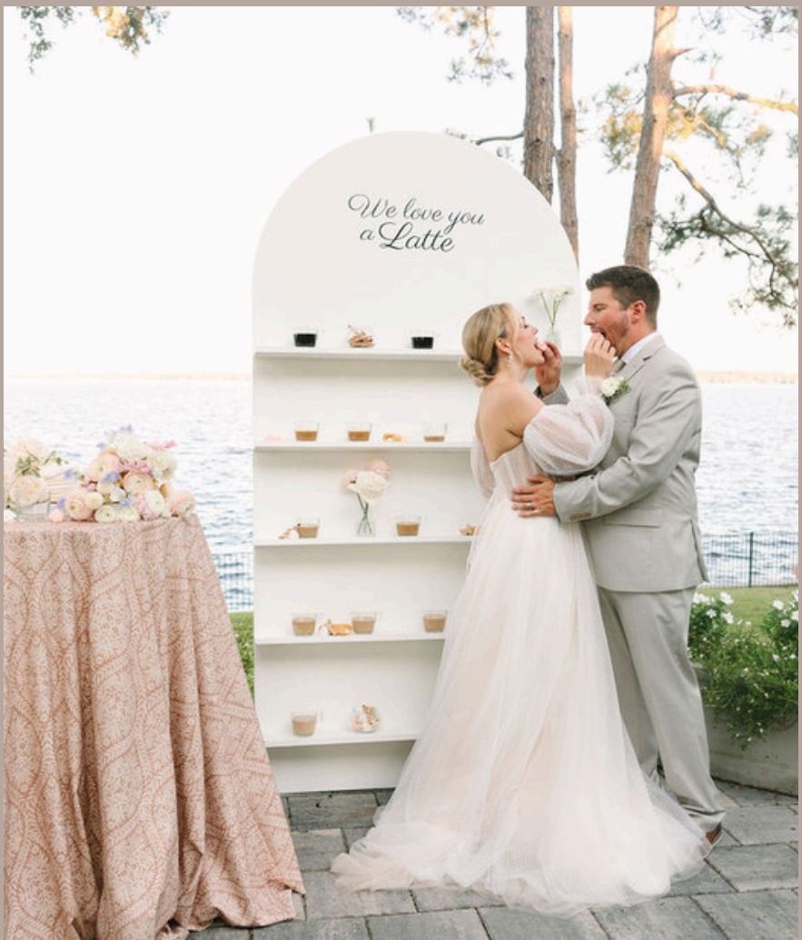
Pavillion Trellis in the color way Woodrose. Creative team behind this table: Planner: La Beau Events Florist: Indy Florals, Rentals: EventWorks Rentals, Coffee Stand Seating Chart: Signature Events Rentals Jacksonville FL, Photography: Lauren Perez Photography HMU: Beauty by Ashley Taylor, Dress: Rachel Ann Bridal, Models: @lyndsay.linder @michaellinder12

Introducing the Pavilion Trellis. Its intricate design combines a delicate print with gentle flowing lines, creating an inviting visual that complements any setting. Available in four richly patterned, earthy shades—Woodrose, Indigo, Fennel, and Turmeric—Pavillion Trellis was curated to harmonize seamlessly with our Scottsdale collection’s natural motifs. Each color is versatile enough to mix and match with other Luxe Linen fabrics, bringing an organic, sophisticated touch to events with its understated, classic allure.