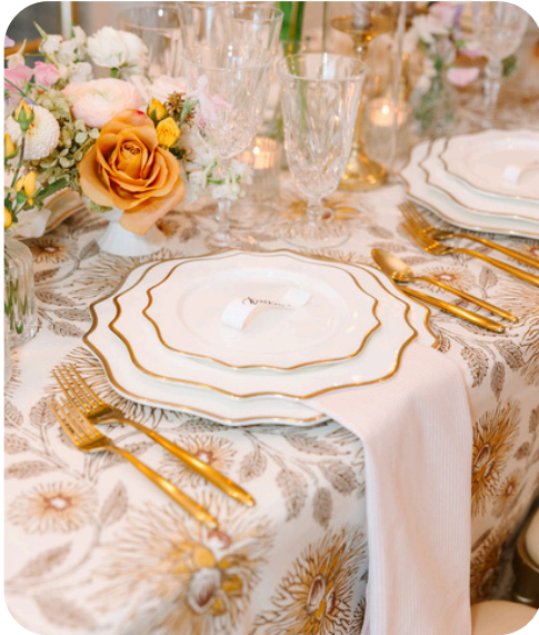
Turmeric Wild Dahlias table linen. Creative team behind this table: Planner: La Beau Events, Florist: Indy Florals, Rentals: EventWorks Rentals, Photography: Lauren Perez Photography