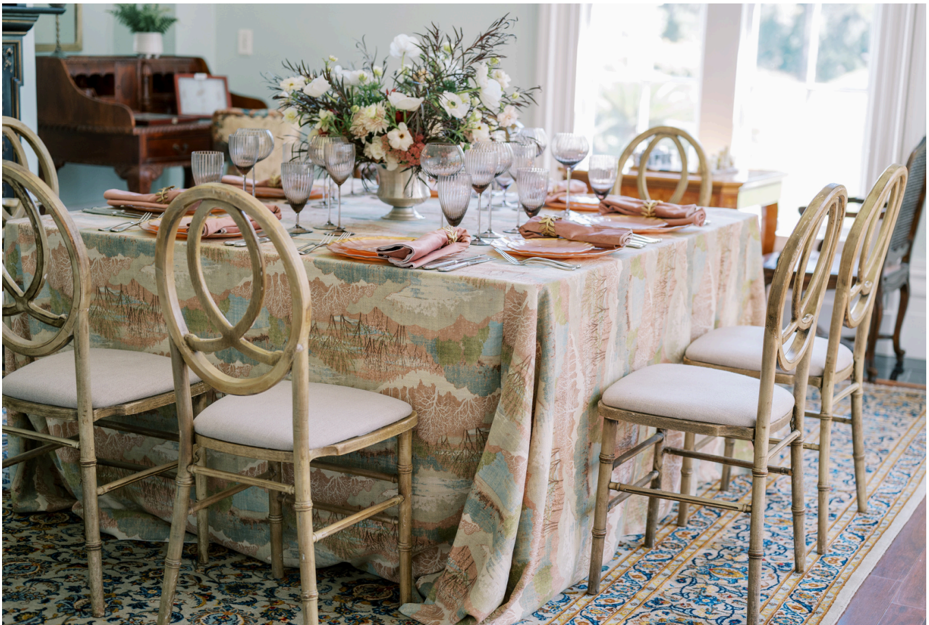
CREATIVE TEAM BEHIND THIS TABLE: PLANNER: STUNNING AND BRILLIANT, HILTON HEAD/SAVANNAH, FLORIST: GRACE AND THORN, VENUE: MANSION AT ROSE HILL, TABLE SETTINGS: EMERSON JAMES, RENTALS: EVENTWORKS

Autumn Gathering Sky linen graced the table with a refined, earthy elegance that perfectly complemented the Southern charm of The Mansion at Rose Hill. Set against the historic beauty of this stately home, the tablescapes came alive with intricate design details that celebrated the venue's timeless allure. The iridescent plates and place settings from Emerson James were true show-stoppers, adding a hint of modern sophistication to the classic Southern decor.