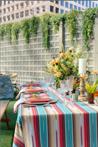
CREATIVE TEAM BEHIND THIS TABLE: CAROL KEINER FROM THE BLUSHING DETAILS, FLOWERS: FRENCH BUCKETS, RENTALS: PREMIERE PARTY RENTALS, VENUE: JONATHAN, CLUB DOWNTOWN LA,