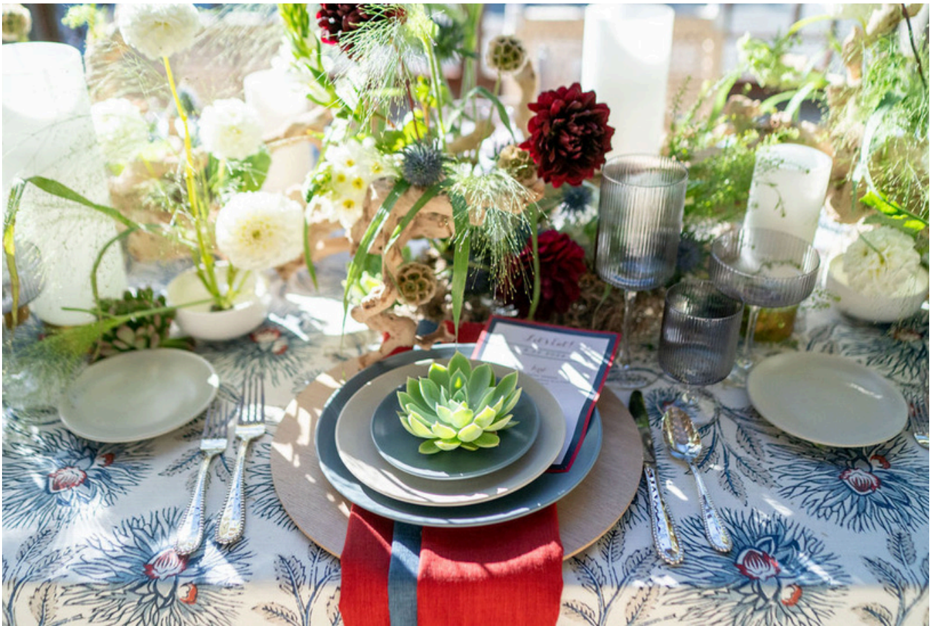
CREATIVE TEAM BEHIND THIS TABLE: PLANNING AND DESIGN: HILARY HAMER WEDDINGS AND EVENTS, FLOWERS: IXORA FLORAL, RENTALS: PREMIERE PARTY RENTALS, VENUE: JONATHAN CLUB DOWNTOWN LA

Hilary Hamer brought our Trail Wild Dahlia linen to life in a way that perfectly captured its spirited elegance. Her table design invites you into a western garden. A combination of earthy and vibrant tones, enhanced by the rich dahlia motif that adds a touch of the wild. The finished product embodies Nuevo Vallarta design, it is coastal, very high end with natural finishes and build on a modern Mexican aesthetic. Every detail, from the layered plates and fresh succulents to the red and blue napkin accents, work to create a cohesive, inviting look that feels like an oasis.