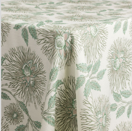
Colorsways offered: Trail (top photo), Turmeric, Trail and Fennel. This linen choice comes in the following table linen options: