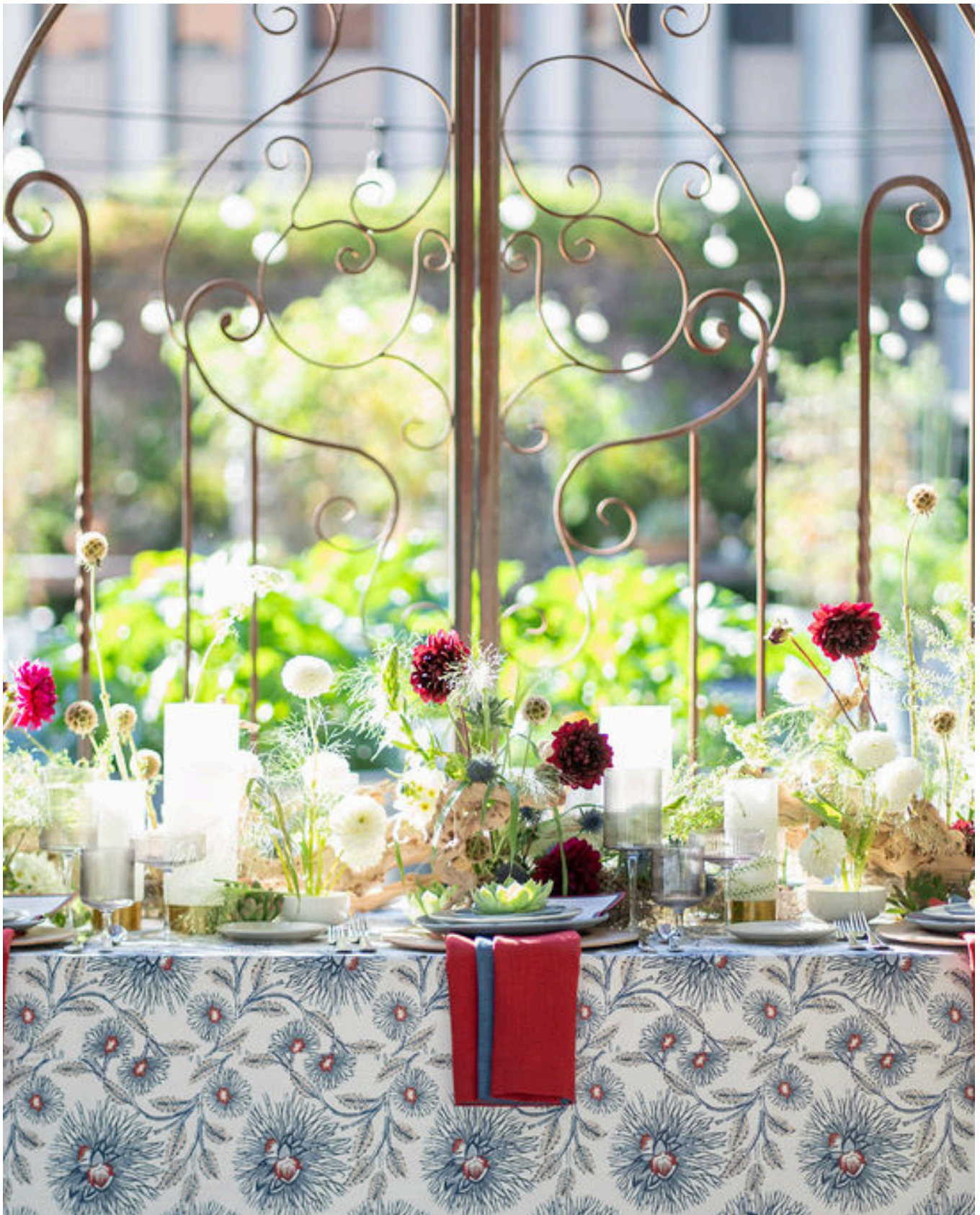
TRAIL WILD DAHLIAS TABLE LINEN PAIRED WITH OUR SMOKEY BLUE AND GARNET TUSCANY NAPKINS.