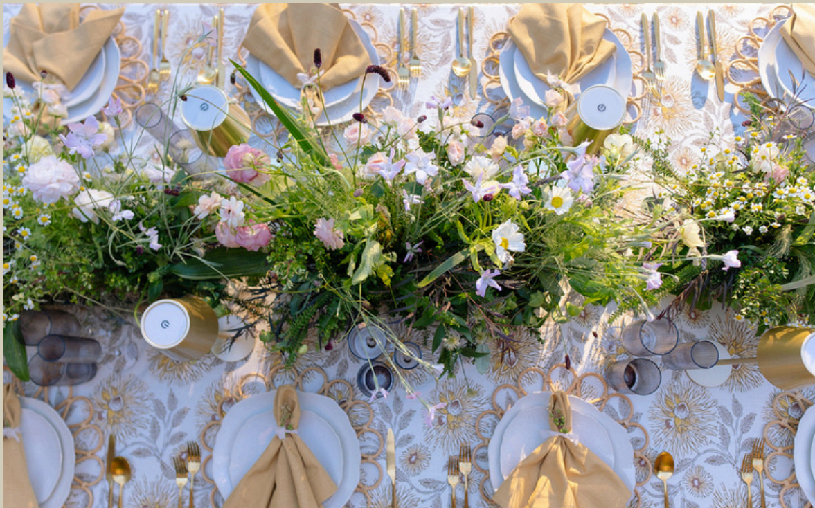
Turmeric Wild Dahlia's Table linen with Sun Glow Tuscany Napkins. Creative team behind this table: Planning, Design: The Blushing Details, Flowers: French Buckets, Rentals: Premiere Party Rentals, Venue: Jonathan Club Downtown LA

At Luxe Linen, we're thrilled to introduce our newest collection, Scottsdale; a true reflection of our unique style and commitment to quality. For over 17 years, we've been dedicated to working with and caring for fabrics, bringing a wealth of experience and expertise to every piece we create.