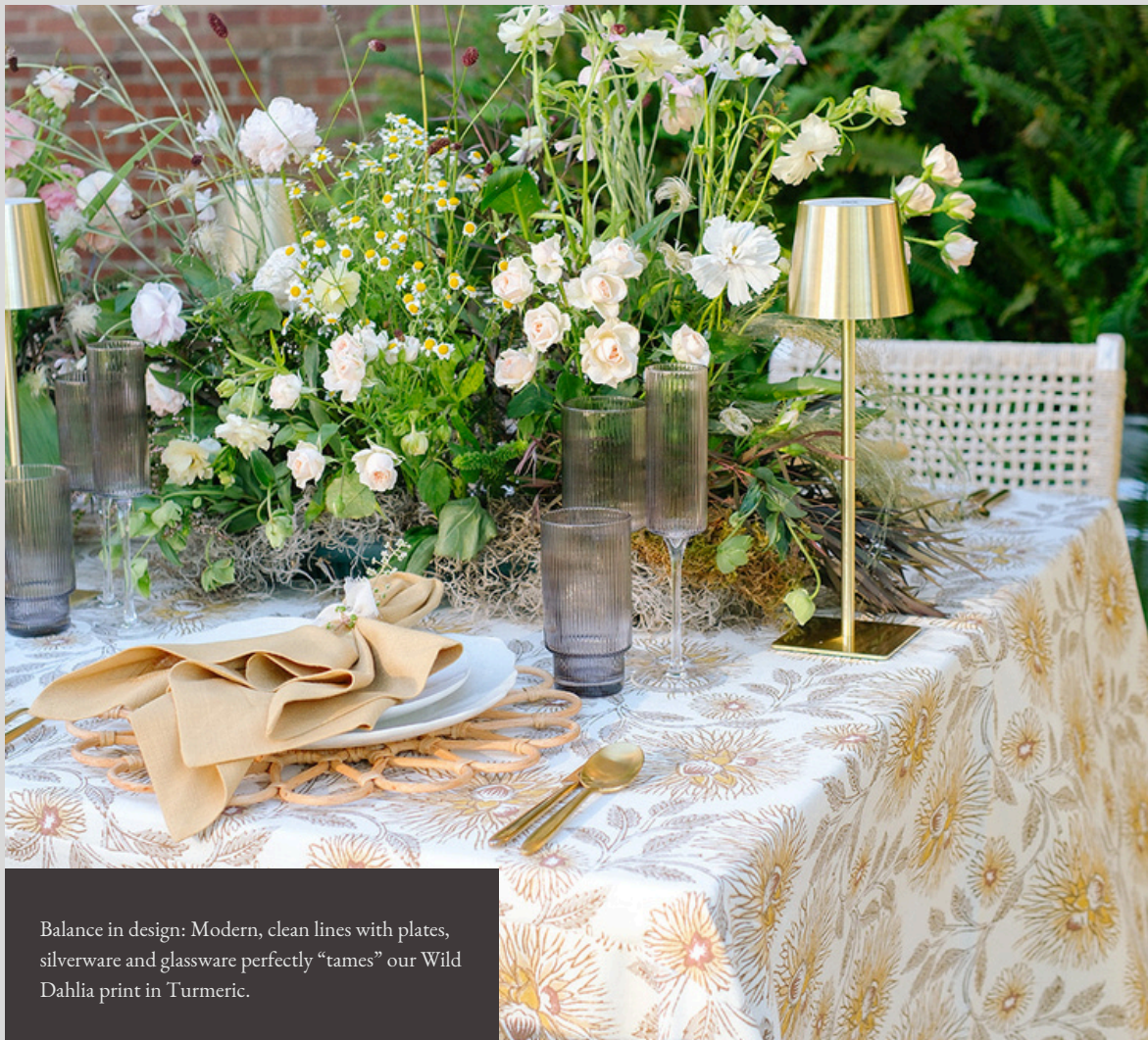
Balance in design: Modern, clean lines with plates, silverware and glassware perfectly “tames” our Wild Dahlia print in Turmeric.