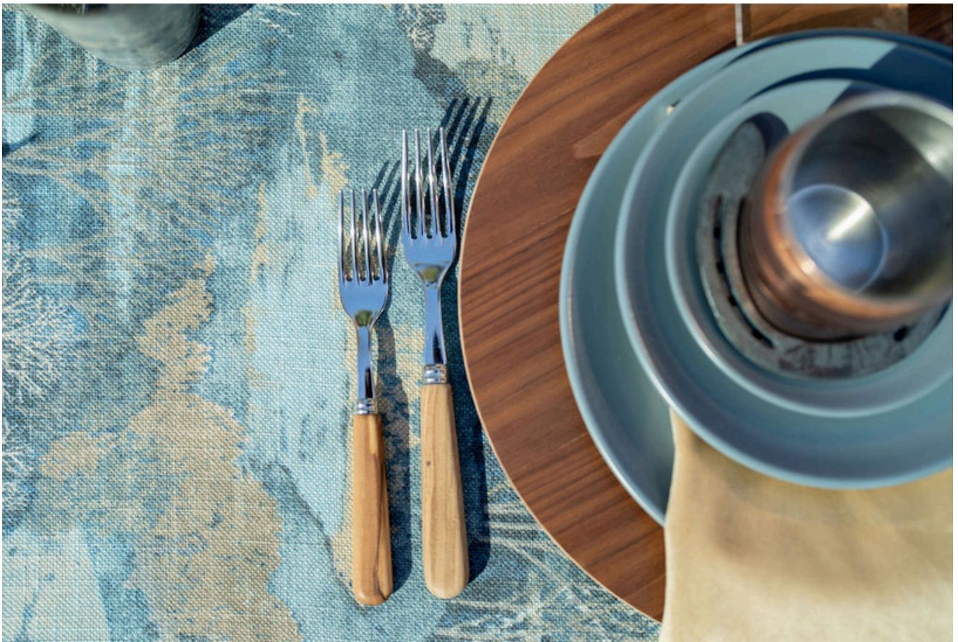
SET DRESSING PERFECTION; TWILIGHT GATHERING SKY PAIRED WITH GLOW FRENCH VELVET NAPKINS