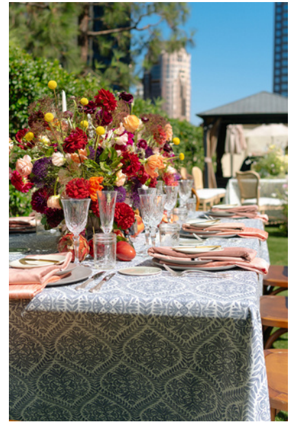
This is our Indigo Pavilion Trellis with Dark Blush French Velvet and Coral Irridescen napkins as styled by Veronique Events.