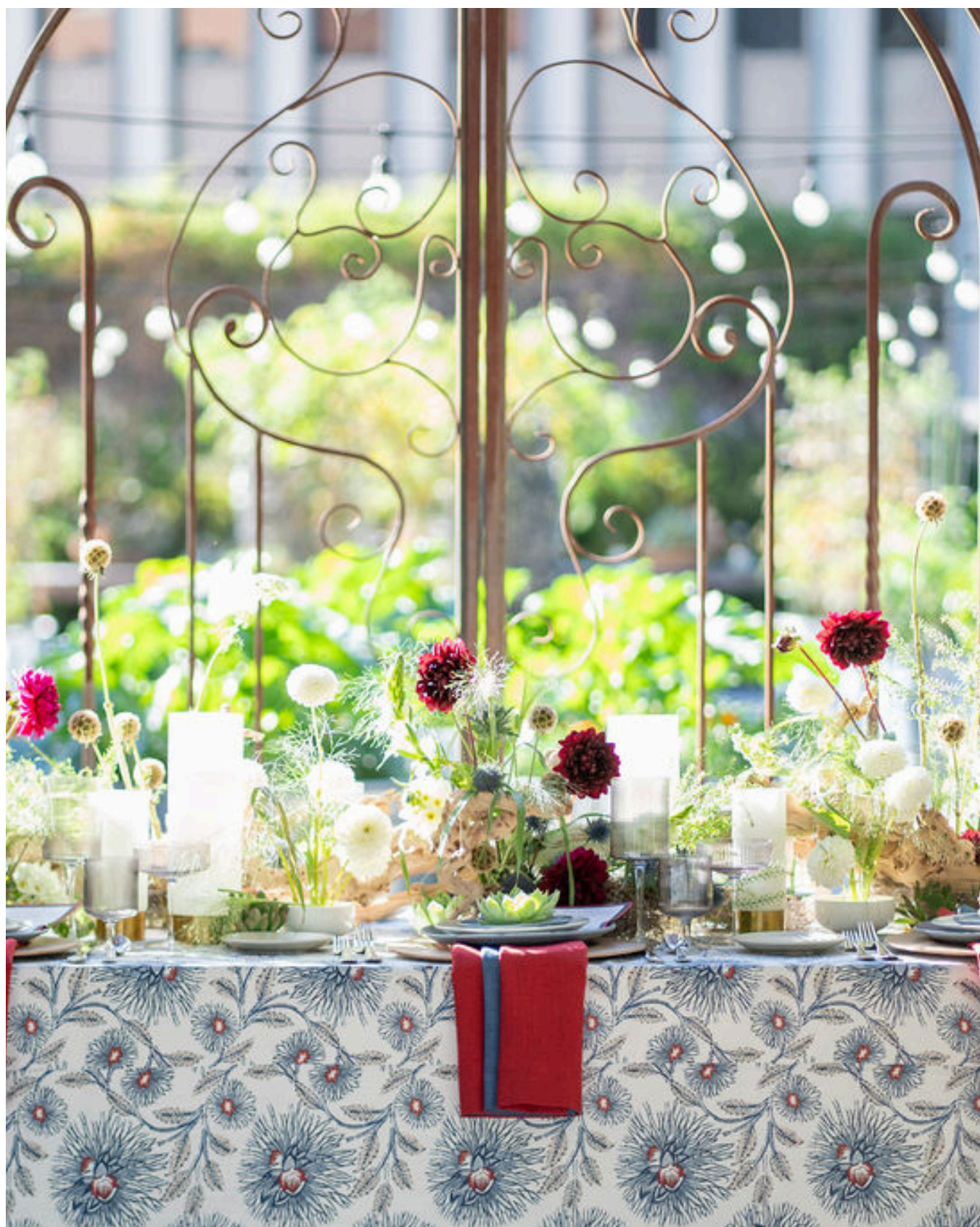
TRAIL WILD DAHLIAS TABLE LINEN PAIRED WITH OUR SMOKEY BLUE AND GARNET TUSCANY NAPKINS.