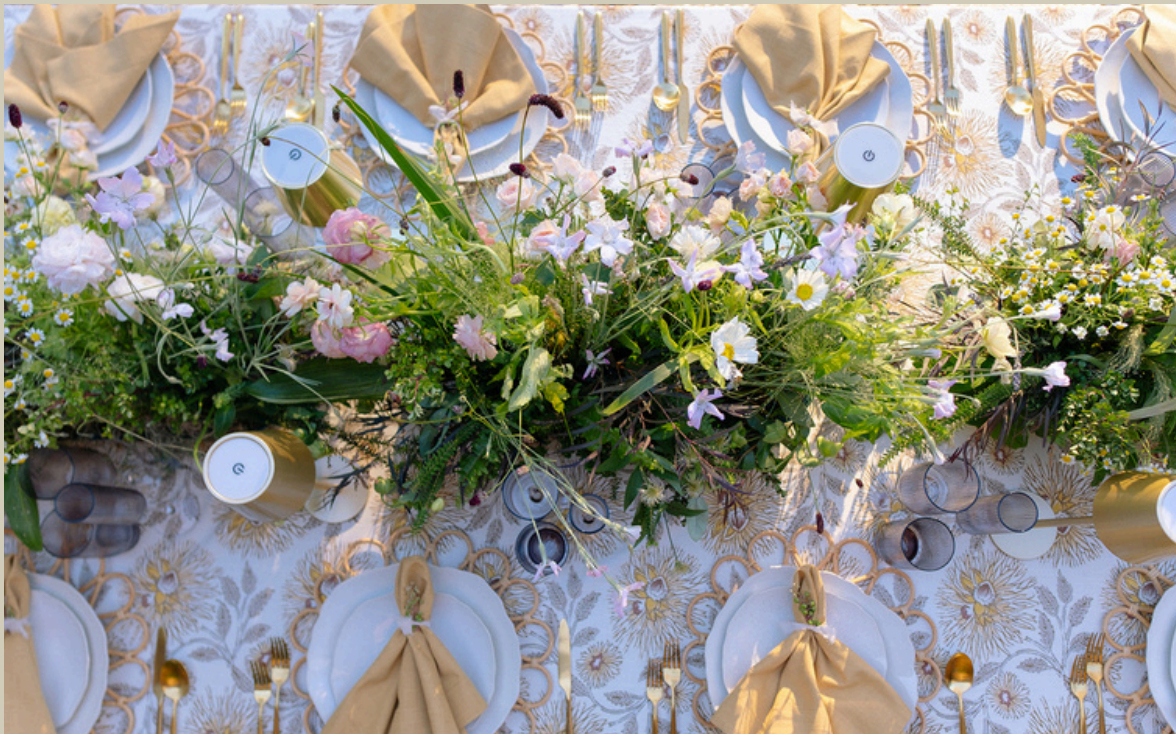
Turmeric Wild Dahlia's Table linen with Sun Glow Tuscany Napkins. Creative team behind this table: Planning, Design: The Blushing Details, Flowers: French Buckets, Rentals: Premiere Party Rentals, Venue: Jonathan Club Downtown LA

At Luxe Linen, we're thrilled to introduce our newest collection, Scottsdale; a true reflection of our unique style and commitment to quality. For over 17 years, we've been dedicated to working with and caring for fabrics, bringing a wealth of experience and expertise to every piece we create.