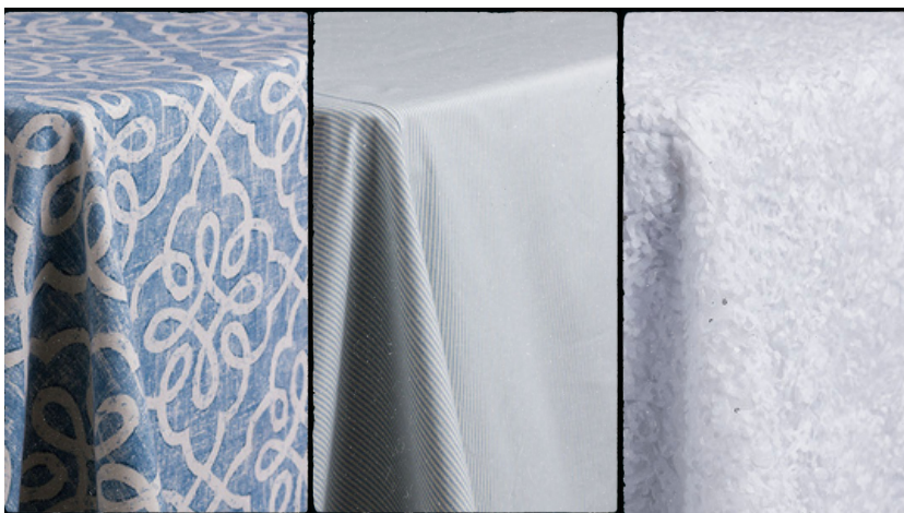
Lexie, Corn Flower Blue Ticking, Snow Heirloom Hydrangea