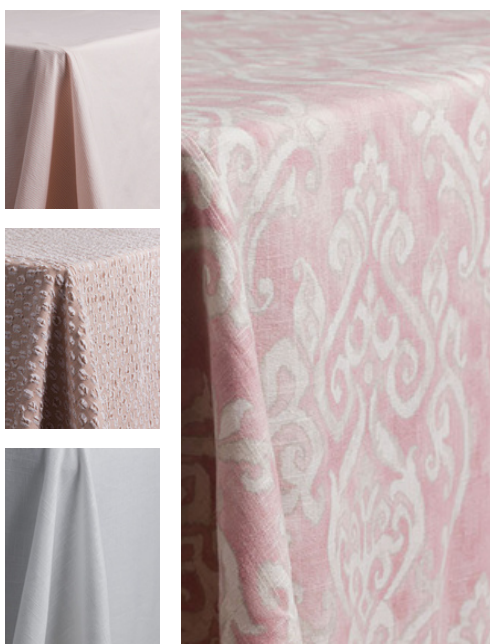
Powder Pink Ticking, Blush Roka, Snow Tuscany and Petal Natalia