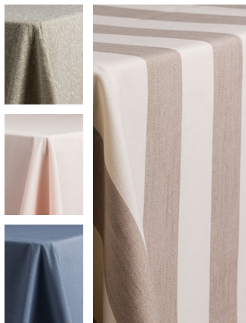
Natural Lola, Blush and Denim Hampton with Antwon