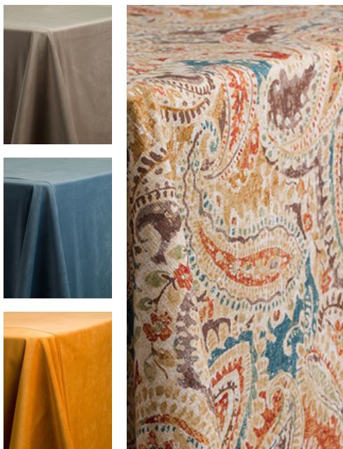
Taupe, Azure and Turmeric French Velvet with Siena Pisces

Designer pallets make planning a beautiful, cohesive event easy.