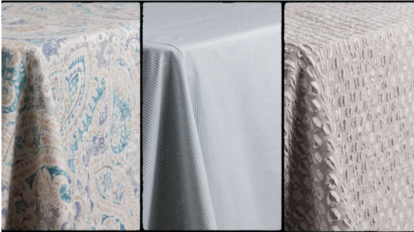
Vapor Pisces, Cornflower Blue Ticking, Dove Grey Roka

Designer pallets make planning a beautiful, cohesive event easy.